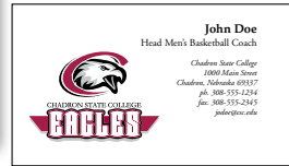
The athletics business card.